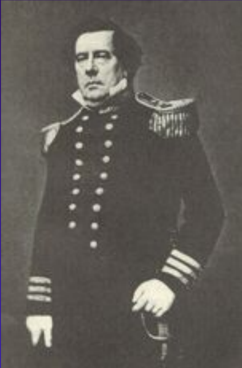
Modern History of Japan